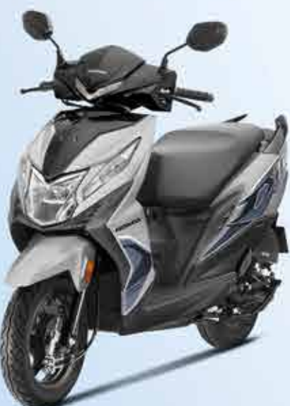
PEARL IGNEOUS BLACK + PEARL DEEP GROUND GRAY